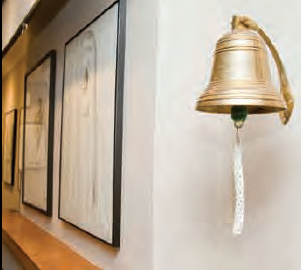
The walls of Wallace House bear testament to its history and its ties to journalism. This bell (top), a gift from the fellows in 2000-01, rings to signal the start of meetings. Behind it are two of the house's many caricatures by widely syndicated cartoonist and Wallace House visitor Patrick Oliphant.

“You really do walk around for most of that year with the idea that anything is possible.”