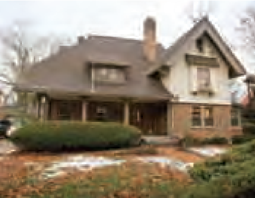
Walk by the Wallace House, the Tudor home on Oxford Road in Ann Arbor, and you wouldn't guess that it is the meeting place of Knight-Wallace Journalism Fellows from across the nation and globe.